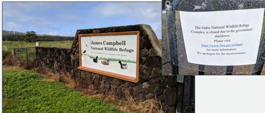
Guided tours were cancelled at James Campbell NWR.

Volunteers visiting the James Campbell National Wildlife Refuge in January on O’ahu, Hawaii were disappointed to learn they would not be able to go on their planned tour because of the shutdown.